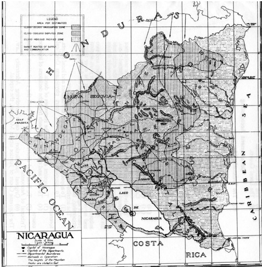
Fig. 3 Guardia Nacional map of Nicaragua's pacified, disputed, and unoccupied zones, Jan. 1929

and its military, the map nonetheless offers new and helpful ways of conceptualizing the country's social and cultural landscape (Fig. 3).